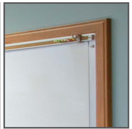
Accent Trim Pieces